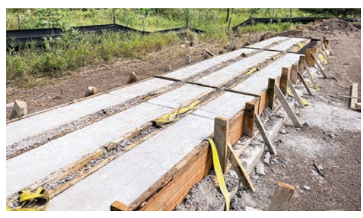
Unsealed concrete castings for the concrete bridge deck.