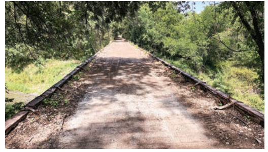
The former railroad bridge, cleared of vegetation debris.