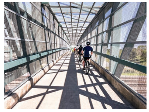
It's no tunnel walk, but still pretty cool!

Since then, Trail Trek has continued its mission of supporting trail development, with funds raised each year directed toward building and