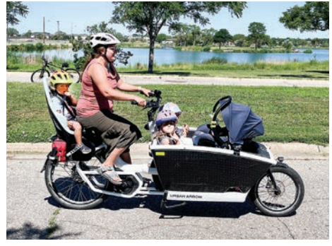
The bike version of a 5-seat mini-van!