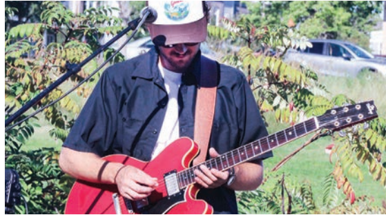
August - Vibe Check