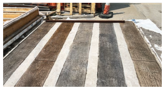
Color samples for sealants for the new bridge deck.