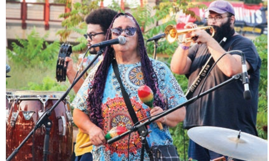
July - Das Dat