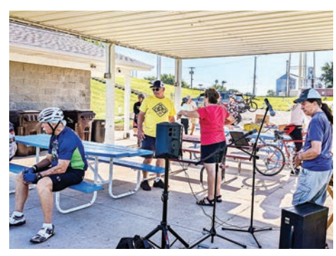
Relaxing at the Eagle rest stop.