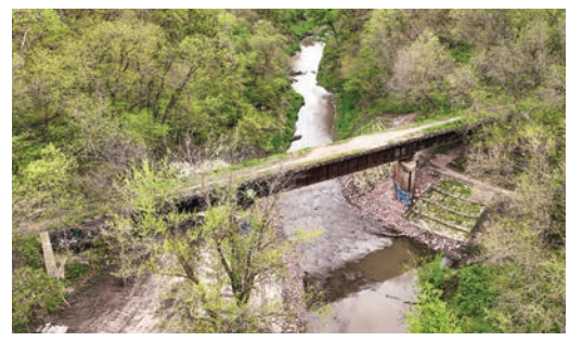
An aerial photograph of the Rock Island Bridge over Salt Creek prior to construction.