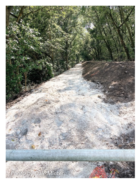
Trail under construction at the point it will connect with the Rock Island Trail west of Densmore Park.

Currently, the contractor is working to cast the 169 concrete panels that will make up the new bridge deck which will be imprinted with a woodgrain texture to mimic the removed timber rail ties. The casting, stamping, and color sealing process has taken a high degree of care to ensure a durable and visually appealing finished product. All project elements are scheduled to be complete and open to the public by the end of the year. This project is being funded through a Federal Land and Water Conservation Fund grant with support from the City of Lincoln, the Lower Platte South Natural Resources District, the Great Plains Trail Network, and with proceeds from the Run for the Bridges event in Wilderness Park.