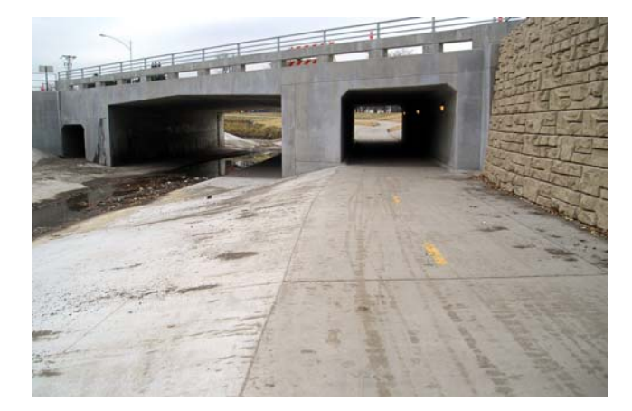
Billy Wolff Continued