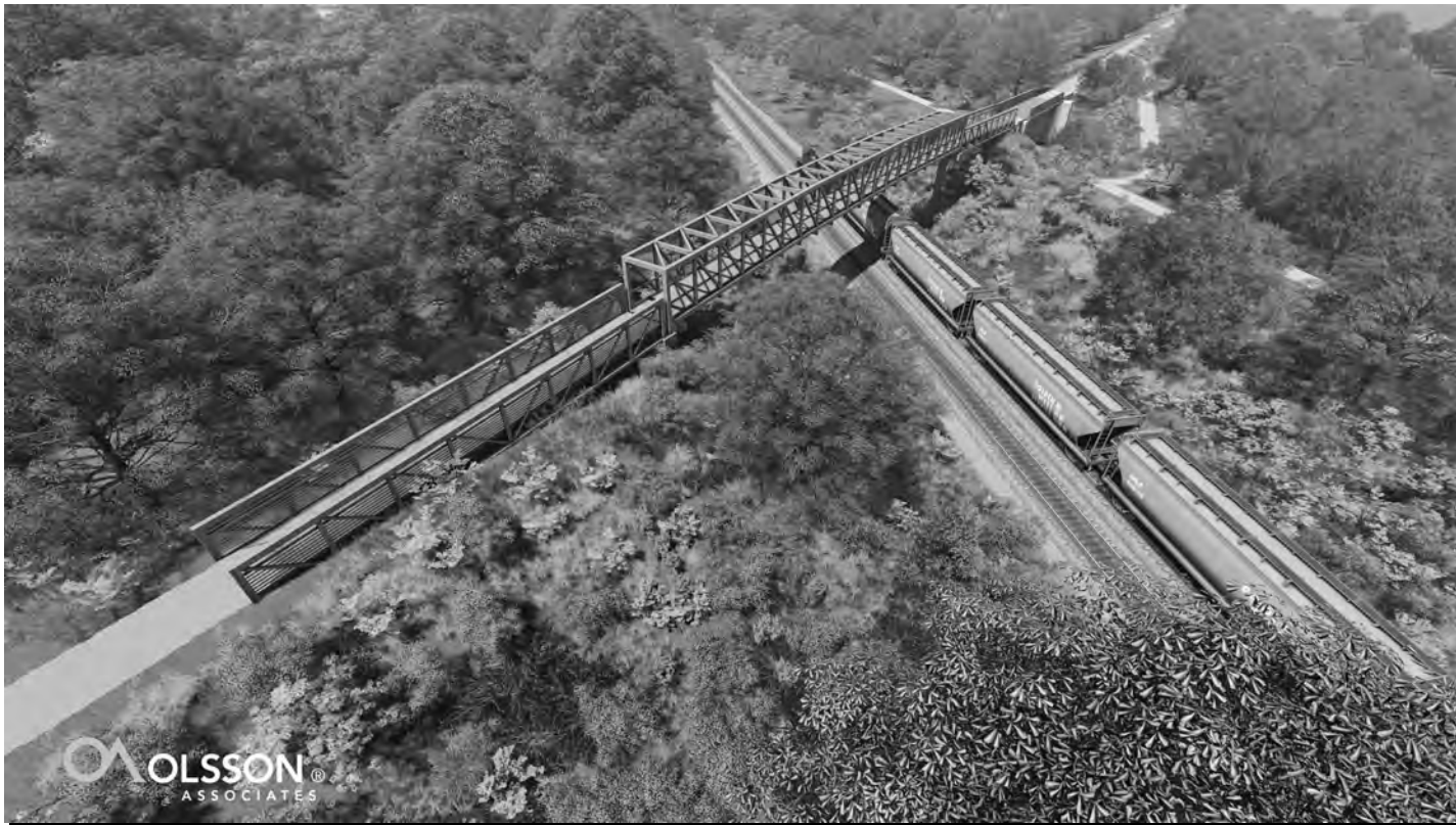
Architectural rendering depicting the Rock Island and Jamaica North Trail Connector Bridge near Cooper YMCA.

See the back panel of this newsletter for more information on how to donate to this exciting project or go online to www.gptn.org . Your donations are greatly appreciated!