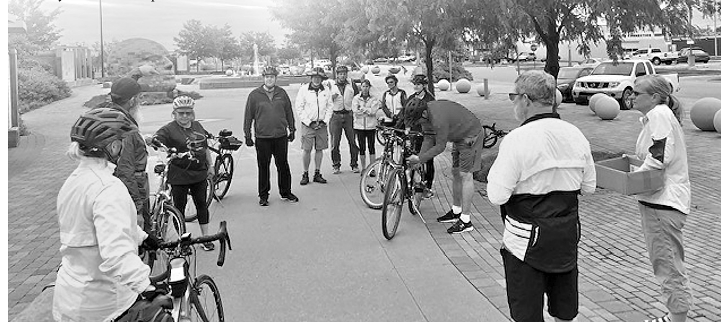
Gathering for one of the 2019 Tour de Lincoln rides

Many riders have never ventured out on trails that are not near their residence, so they welcome the opportunity to see where a new trail leads them. There is usually someone from each ride that tells us they are new to Lincoln and the trails, so Tour de Lincoln allows them the chance to learn about our trails, and this year was no exception.