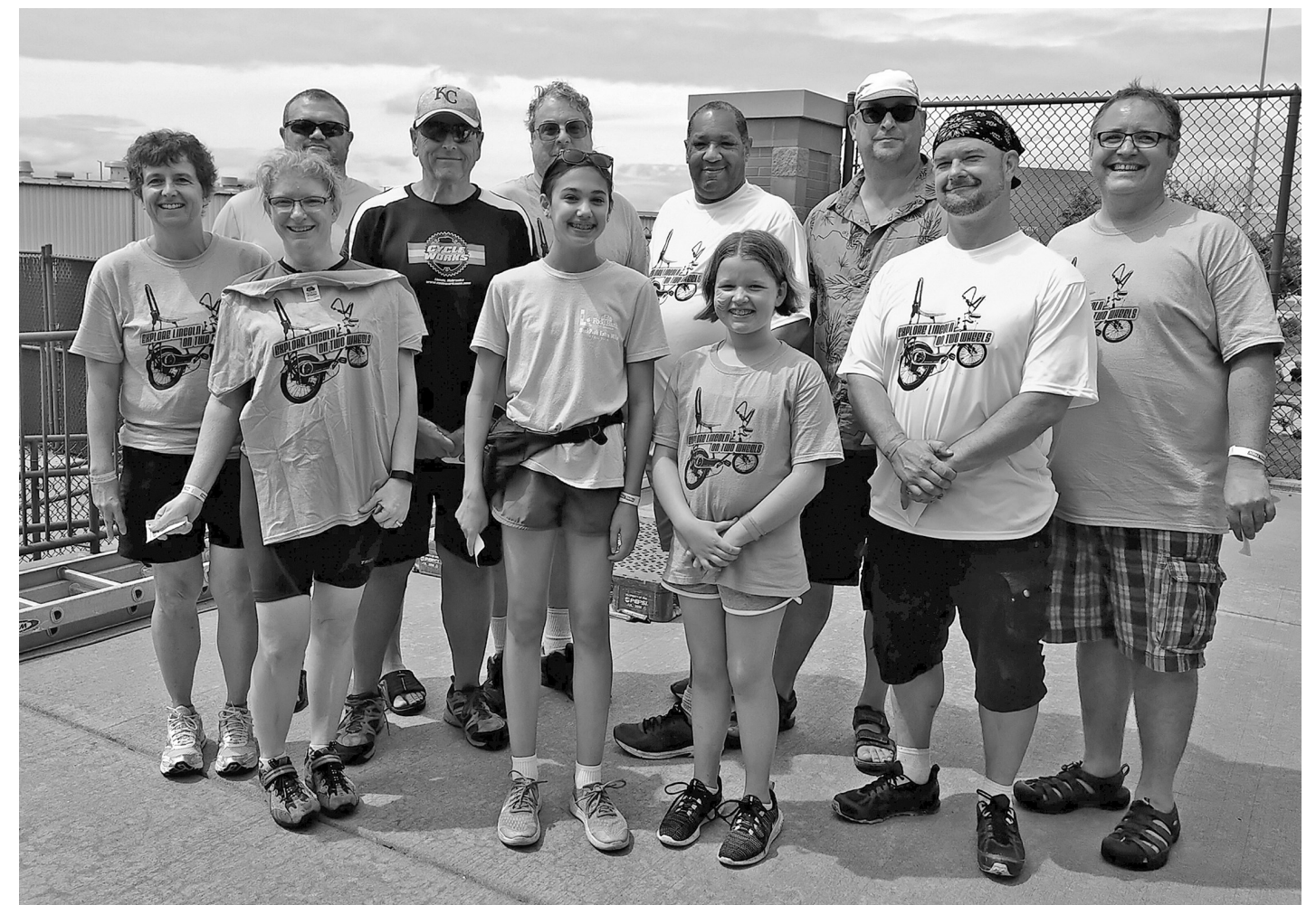
The 2019 Trail Trek Bike Winners.