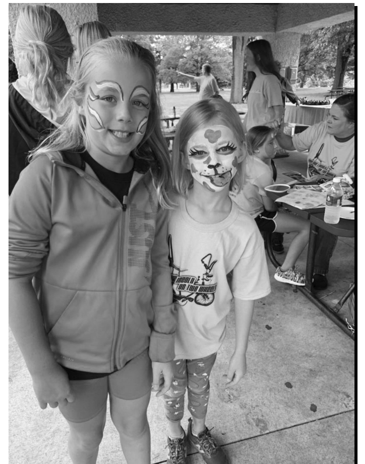
Kids had fun getting their face painted at Antelope Park.

Mail to: GPTN P.O. 82902 Lincoln, NE 68501-2902