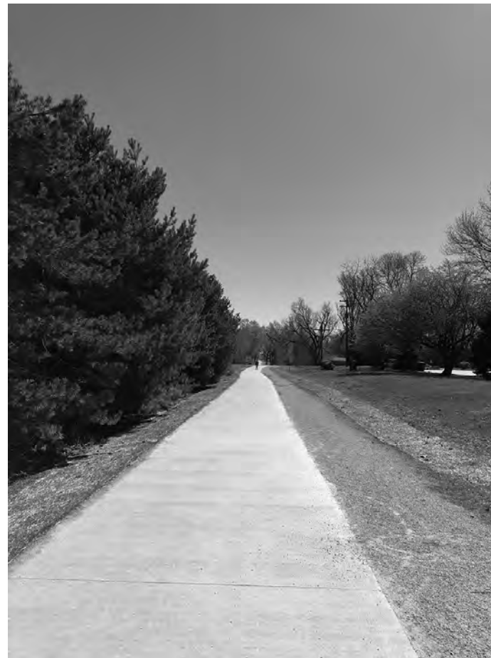
Murdock Trail after reconstruction.