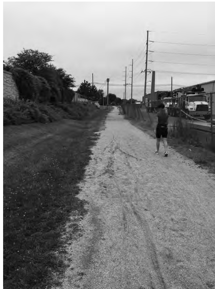
Murdock Trail before reconstruction.

With the upgrade the Murdock Trail is now one of Lincoln's premier trails. The side-by-side feature is one which might be used on other city trails. A special thanks to all who donated to this project. GPTN members can make a difference!