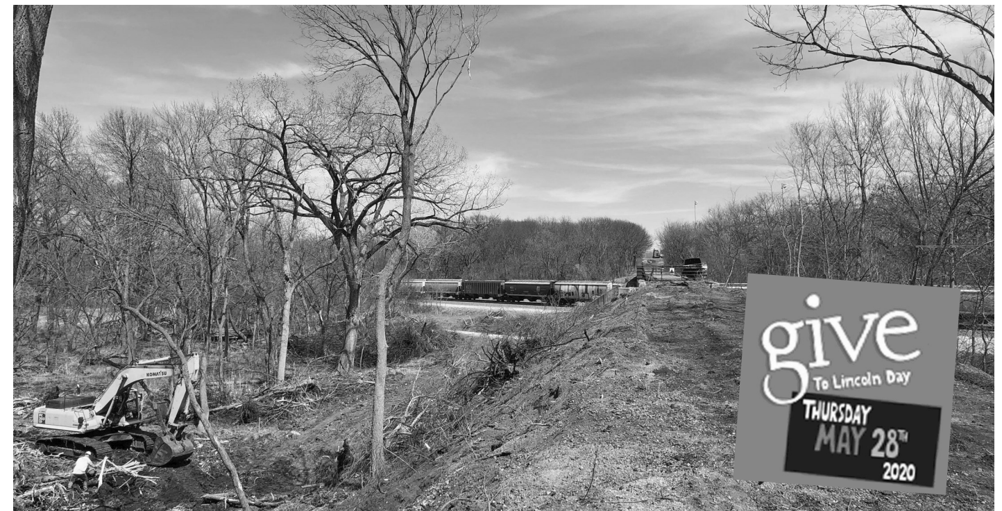
Construction at the Rock Island—Jamaica North Trail Connection—Looking east towards Densmore Park.

For the first time, GPTN will be offering our own bike jersey for sale. Place your order between April 1 to May 15. For more information and ordering, go to www.gptn.org