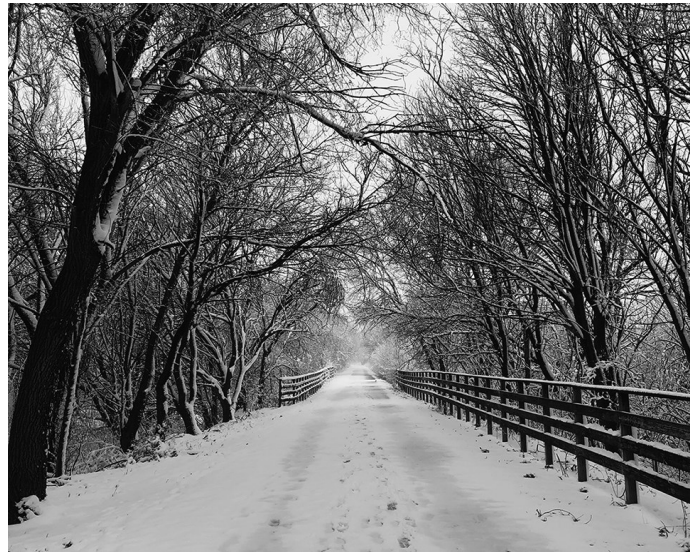
Winter wonderland

Trail Trek couldn't happen with support from our local businesses, so please if you can give them some love we'd appreciate it: Bike Rack, Cycle Works, Pepsi-Cola of Lincoln, Hy-Vee, Olsson, Kidwell, LES, Bryan Health, Alpha Media, UBT, Good Life Fitness, Sutton Dermatology & Aesthetics and the University of Nebraska Federal Credit Union.