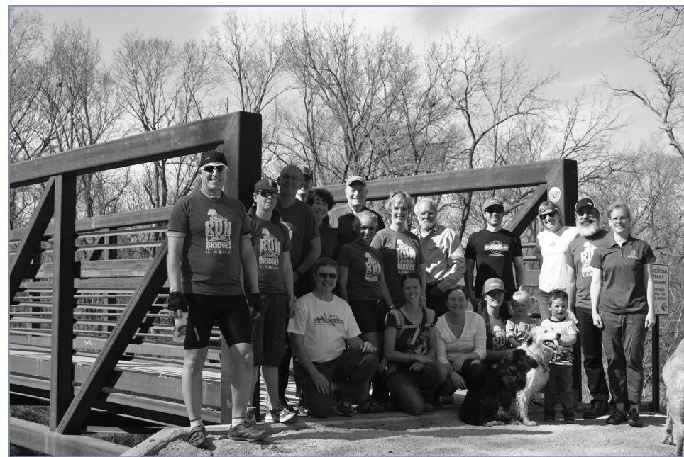
Celebrating the completion of the Wilderness Park Bridge between Pioneer Blvd and Old Cheney. The Run to Bridges event raised over $8,500 this spring to support replacing the second bridge in Wilderness Park.

Pioneers Park Trail – Phase III is in the initial phase of design. This project will provide a connection along the southern edge of Pioneers Park with the western edge of the park. Expected completion is August 2016.