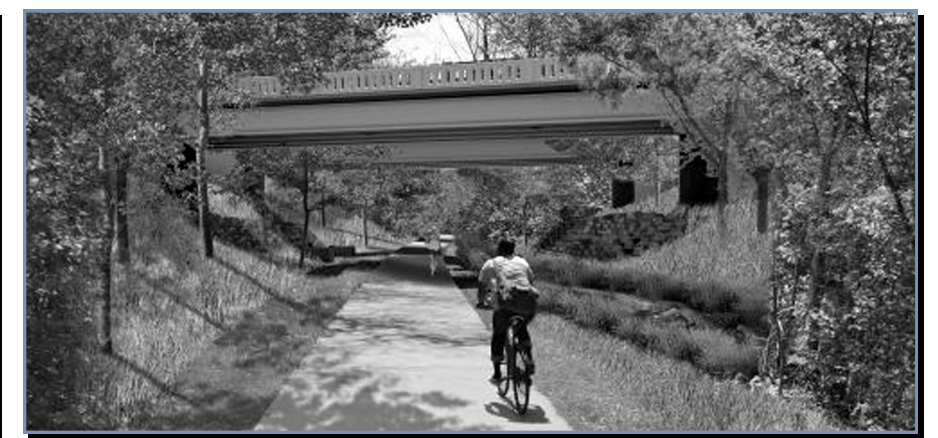
A rendering illustrating what the new bridge will look like when completed.