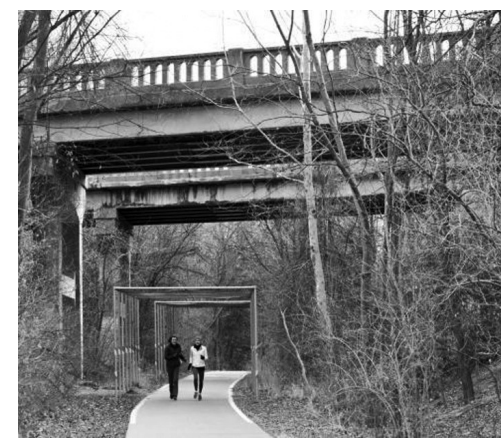
Concrete cages protecting pedestrians.

And not one of them will have to pay an extra penny.