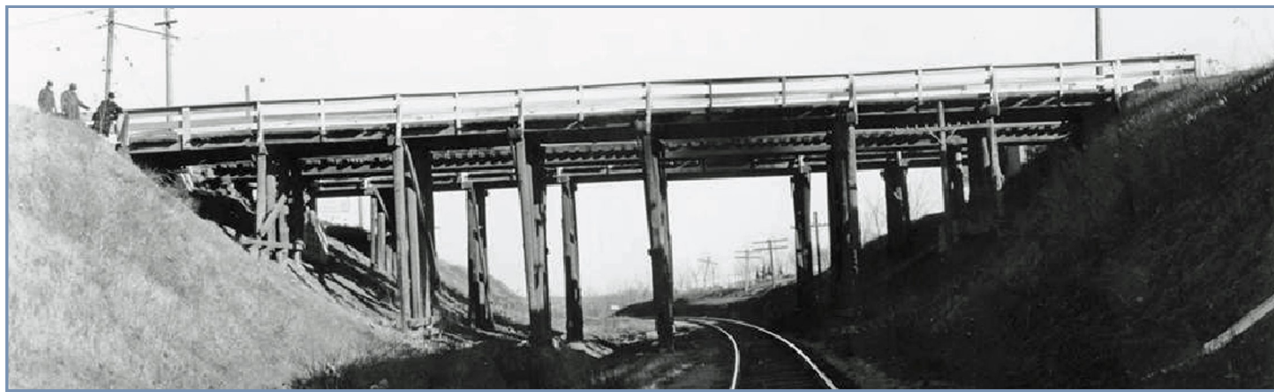
A view of Penny Bridge I from the tracks of the Chicago, Rock Island & Pacific Railroad--the future site of the Rock Island Trail.

Penny Bridge II and its much-admired concrete railings served trolley, motor vehicle and pedestrian traffic very well. Trolley-users continued to ride to Peanut Hill, paying the extra fare through September 1, 1945—the day before VJ Day—when WWII restrictions were lifted and the more-desirable buses could take urban people-moving all over the country. WWII restrictions on the use of rubber (and gasoline) meant that buses had to take a back seat to trolleys until the war ended. Worn tires could not be replaced, and the federal government told cities to keep the trolleys until the war was over. VJ day was September 2, 1945.